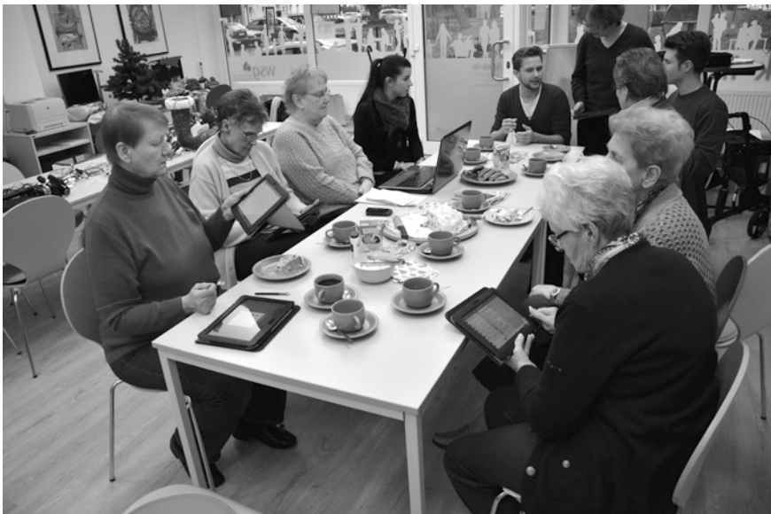
Fig. 1 Coffee, cake and cooperative technology exploration

When some elderly tenants signaled interest in getting deeper into tablet usage, we started to organize an own bi-weekly workshop in the community room, commencing the “tradition” of starting the sessions with coffee and cake (see Fig. 1). At that point of the project, we also were able to hand out mobile devices to about 15 interested elderly people. The workshops were essentially aimed at spanning up a bridge between actual practices of the peoples’ conduct of every-day life and the ability to imagine possible futures of meaningful ICT support, i.e. to span up a