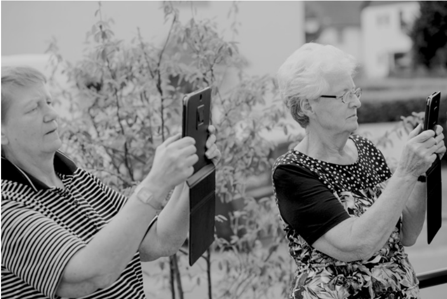
Fig. 2 Participants taking photos with their tablets

it also became evident that constant repetition and usage of the medium was necessary and a key to understanding and memorizing the functionalities. Nowadays, for most, writing and receiving emails is not a novelty anymore but has become a part of their life and a contribution to their quality of live.