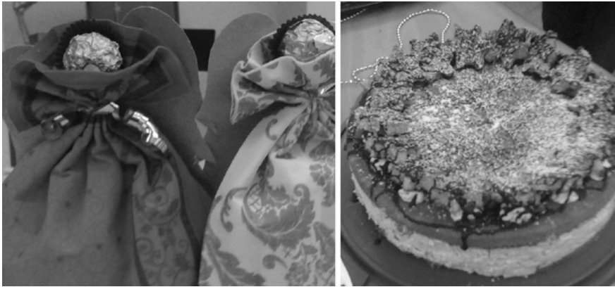
Fig. 3 Self-made christmas decoration and cake