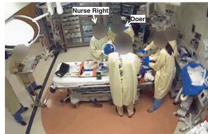
Fig. 3 Excerpt from Team 5, Scenario B

Because responsibilities are clearly specified for each role, team members pay particular attention to activities that are highly relevant to their tasks. Often times, however, some roles would assist with tasks that have limited relevance to their own work, as illustrated below in the example from Team 5, Scenario B (Fig. 3).