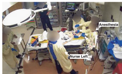
Fig. 5 Excerpt from Team 8, Scenario A